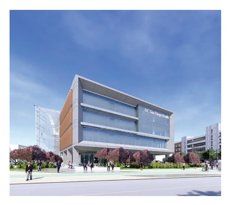
The first phase of redevelopment includes a 250,000-square-foot outpatient pavilion and a 1,850-space parking structure.

This phase also includes a 1,850-space parking structure anticipated to open in at the end of 2023, which will allow for the demolition of the existing Bachman and Arbor parking structures, consolidating patient and employee parking for improved patient and caregiver access and experience.